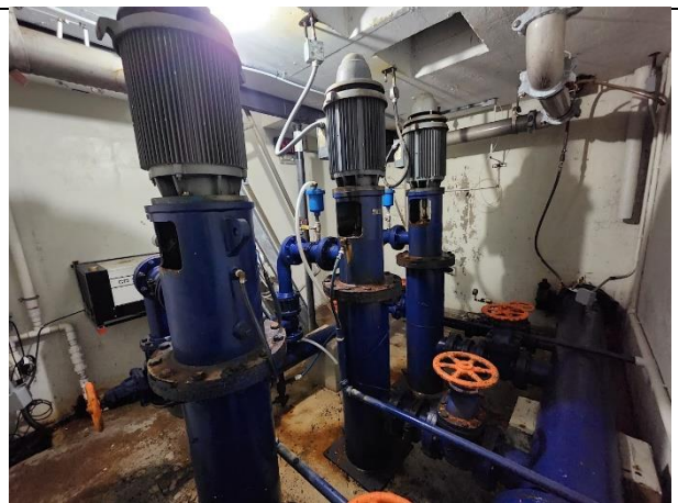
Pumps & Distribution System