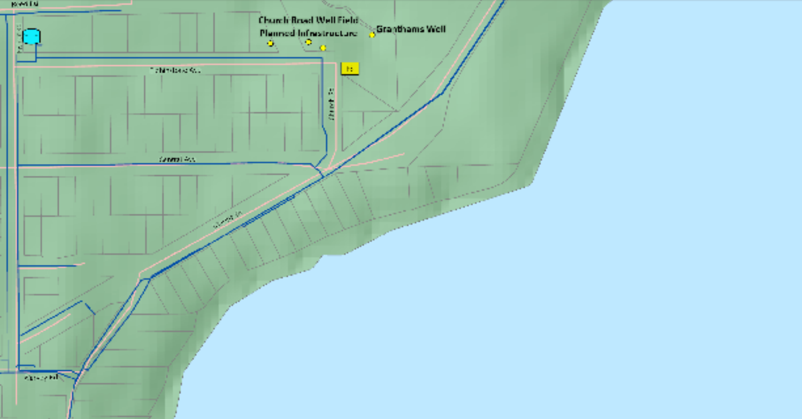
Granthams Water System Infrastructure