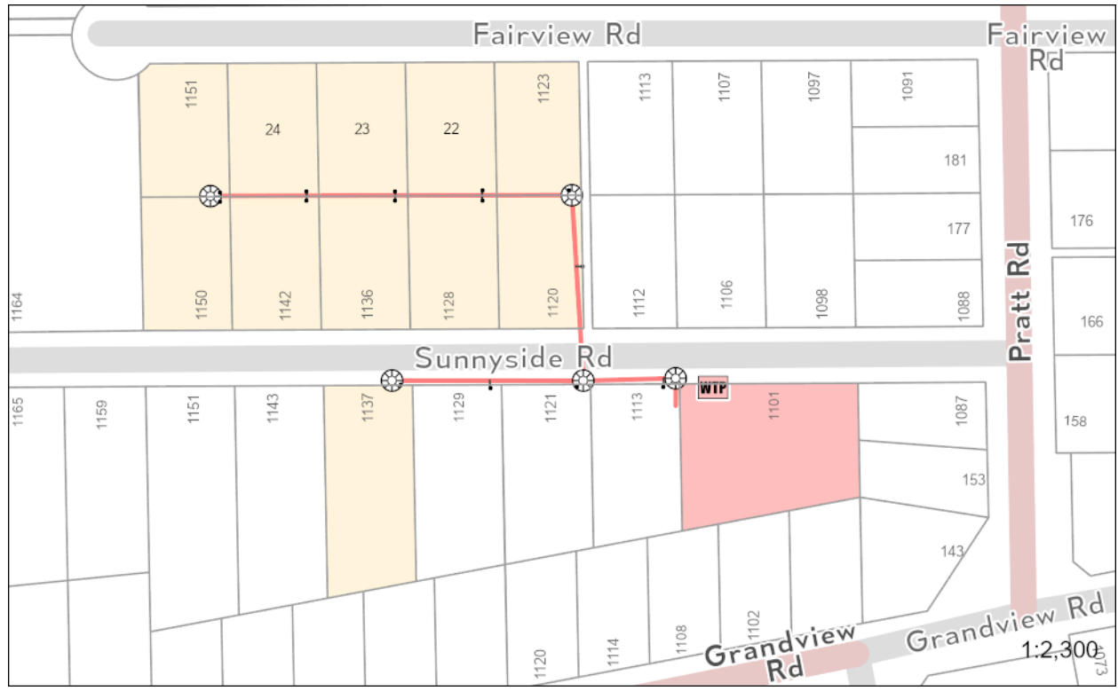
Figure 1 – Map of Wastewater Local Service Area and Infrastructure