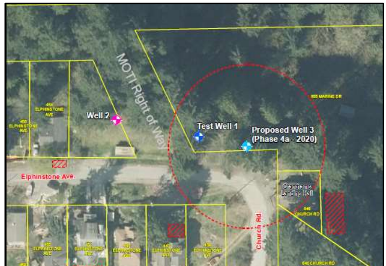
Location of Well 3. Drilling and pump testing is scheduled for Summer 2020.

The final phase (Phase 4 Part B) will include the construction of the water treatment plant and other connected infrastructure. An update on the construction timelines will be released in Fall 2020.