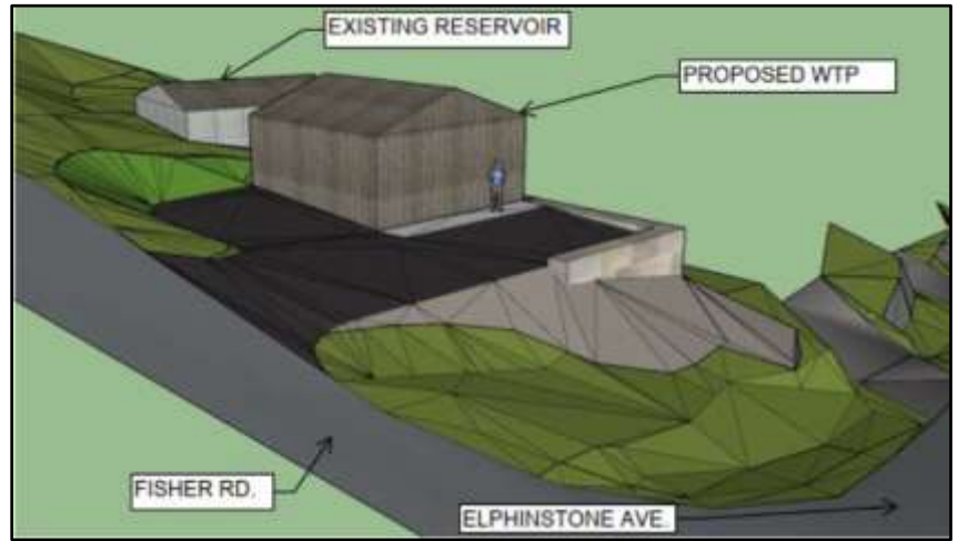
Location of building to be constructed for water treatment and pumping, next to existing reservoir for treated water.

A combination water treatment plant and pump station will be constructed on the SCRD property at the corner of Elphinstone Avenue and Fisher Road. The current Granthams Reservoir will remain in use. The new building will house all of the equipment necessary to disinfect the water coming from the wells, and pump it out into the distribution system. The building will be approximately the same size as the existing reservoir.