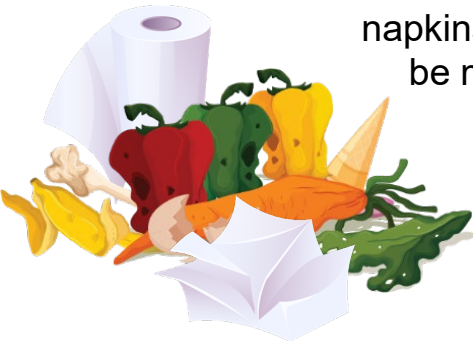
Table scraps, vegetable peels, napkins and tea bags can all be made into compost!