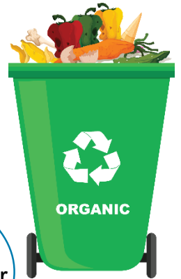
Table scraps, vegetable peels, napkins and tea bags can all be made into compost!

How? Use your Green Bin or compost at home.