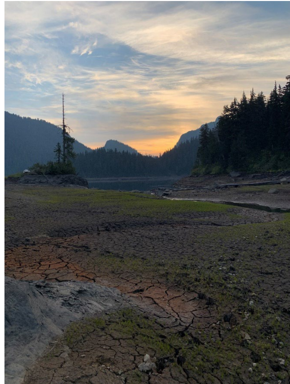
Chapman Lake, October 7