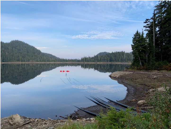
Edwards Lake, October 7