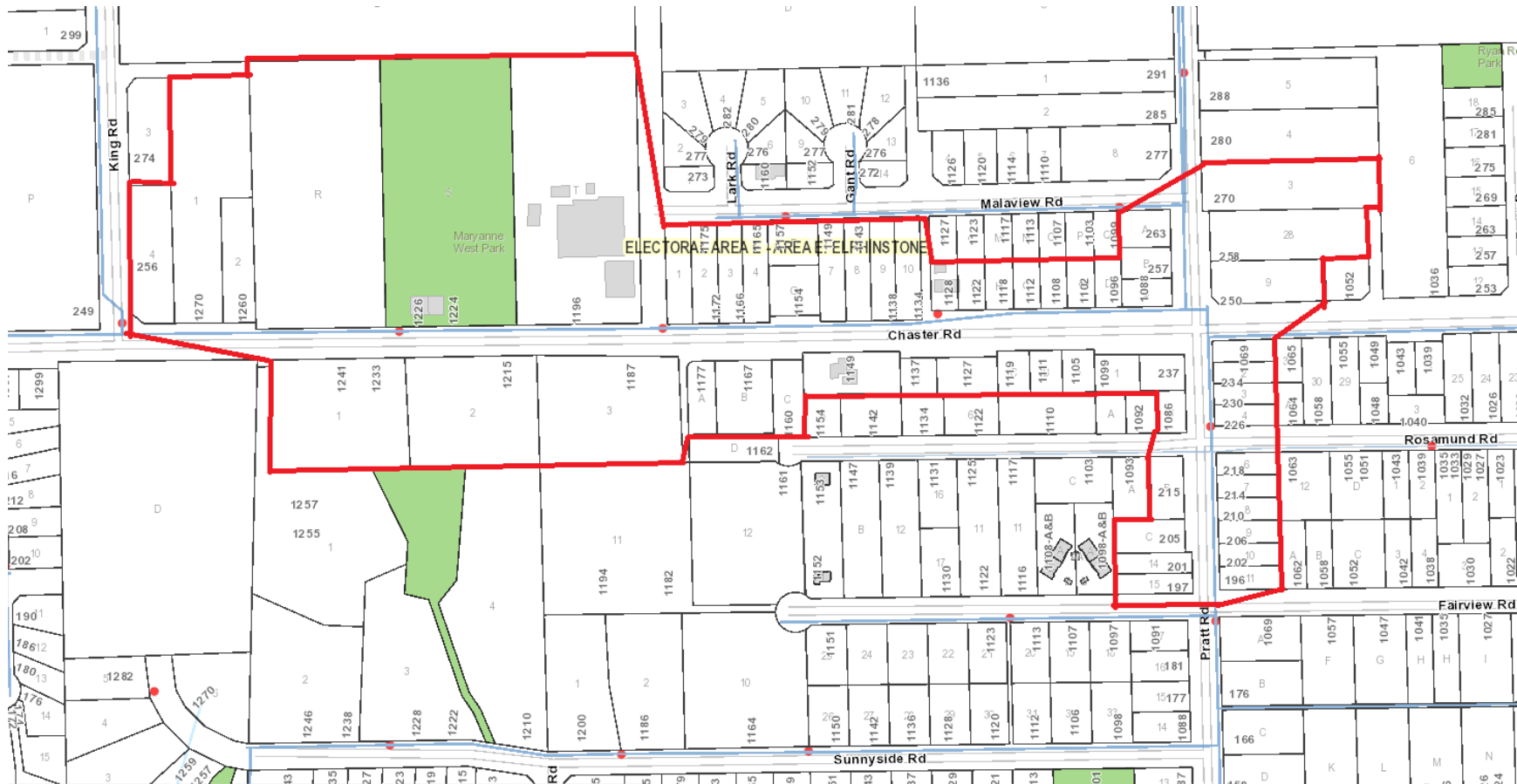
Figure 2 – Extensive Affected area and Civic Addresses from Water Main tie-in and decommissioning Works